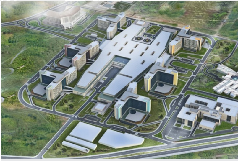
Bilkent Integrated Health Campus 3660 Bed Capacity Partnership with Siemens - Fully Integrated System

Over 700 systems installed worldwide. Over 30 million patient served.