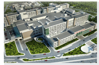
Eskisehir Integrated Health Campus 1080 Bed Capacity