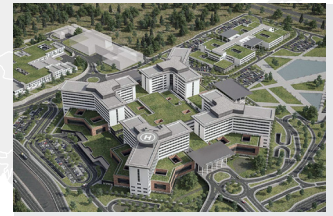
Adana Integrated Health Campus 1550 Bed Capacity