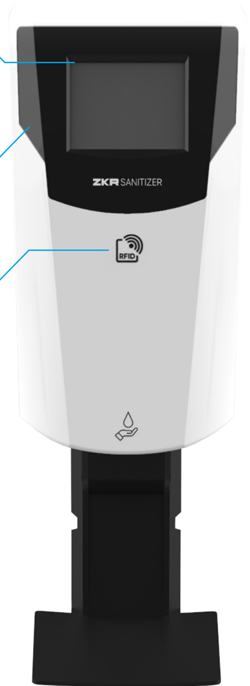
Wall & Floor Protection

The device can communicate wirelessly with the central ZSmart server with its built-in WiFi. Data such as usage statistics, device status, error logs, and remaining sanitizer liquid are recorded on the server. All devices on the network can be monitored in real time through the server. Any required configuration changes can be centrally implemented through the server application.